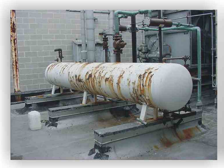
Badly rusted pressure tank and support legs. Project called for grit blasting tank and supports, then treating with CHEMCLAD SC (2 coats).