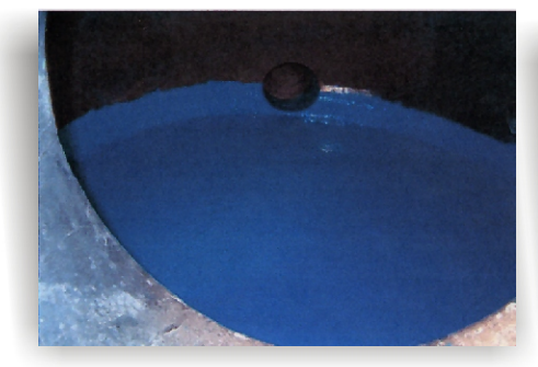
Water box repaired & coated