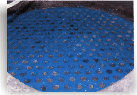
Tube sheet repaired & protected