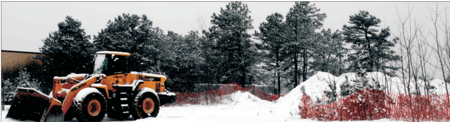
During the worst snowstorm of the season, over 50 invited guests as well as ENECON employees braved the cold to celebrate the ground breaking for our new corporate headquarters which is scheduled to be completed later this year.