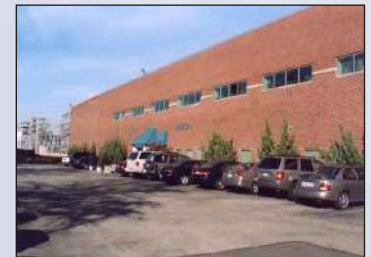
ENECON's current headquarters