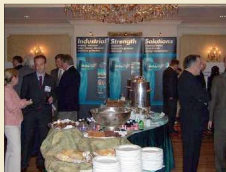
Plenty of talking...and eating