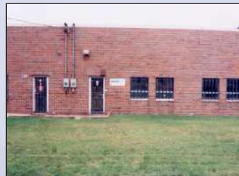
ENECON's 1st warehouse