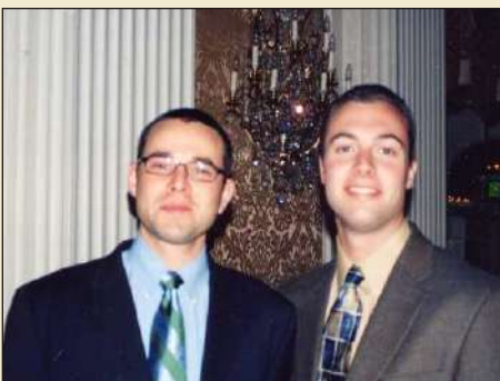
ENECON's "young turks"