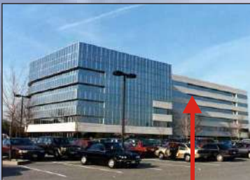
ENECON's 1st office