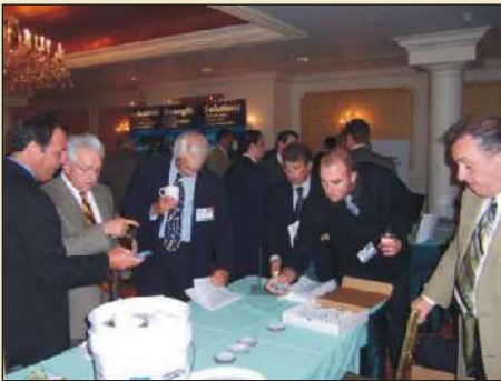
CeramAlloy CBX gets plenty of attention.