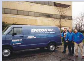
ENECON's 2nd office Suite