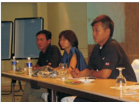
The ENECON Singapore team