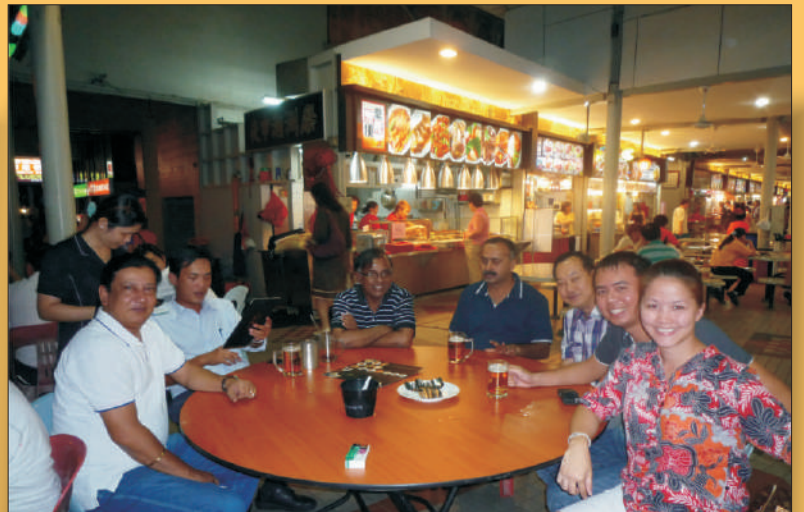
Everyone had a wonderful time at Bugi's Outdoor Market Restaurant.

suggestions of the more experienced members of the group. The presentations by the senior distributors included a comprehensive analysis of the sales process, marketing strategies on how to reach customers, concentrating on product superiority as a selling point and the heart and soul of the business, i.e. the importance of