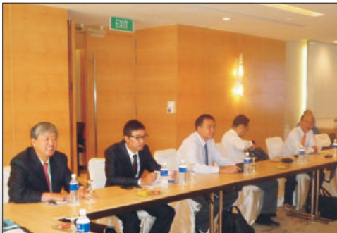
Presenting to the group

Toward this end, the questions and ideas raised by newer distributors were met with the experiences and