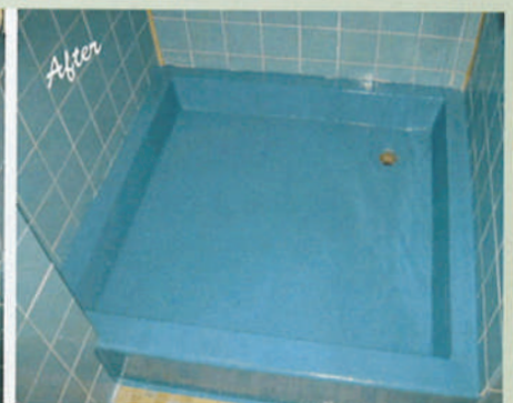
Shower before and after Enecon application