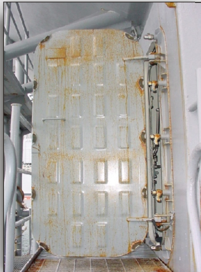
Powder coated doors after a few months at sea.