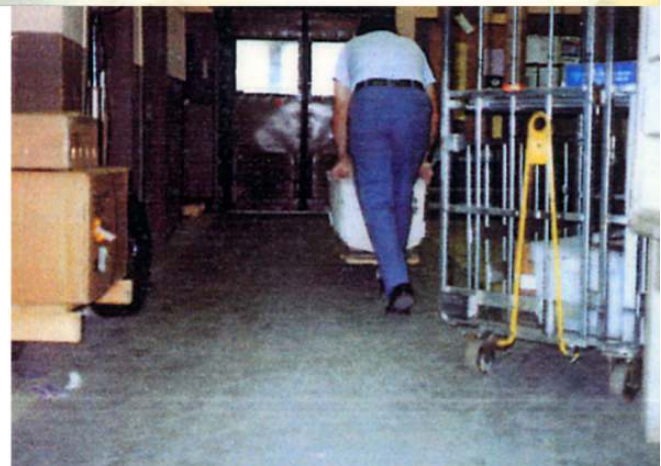
DuraQuartz providing years of trouble-free performance at Postal Center loading area.