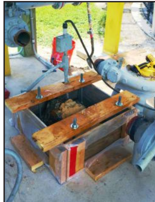
Bolt placement guides.