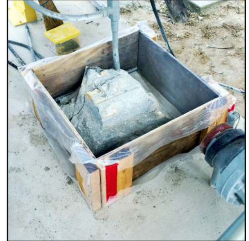
Former with plastic sheeting.