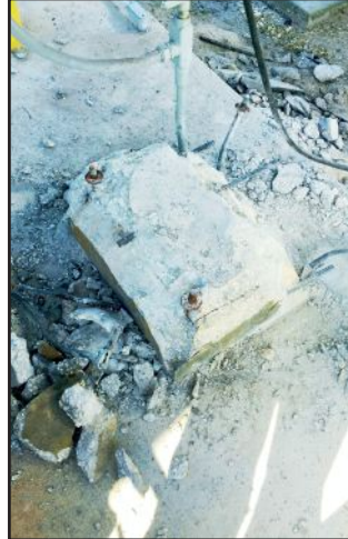
Damaged pump base.

The project was completed to the facility engineer's satisfaction on time and under budget and well within the mandated D.E.P. permit guidelines.