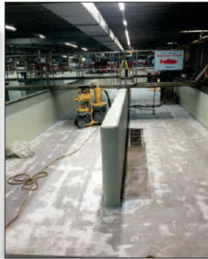
Pool floor prepared