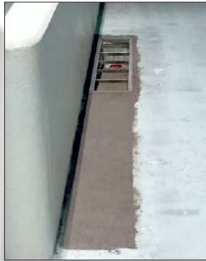
New filter installed