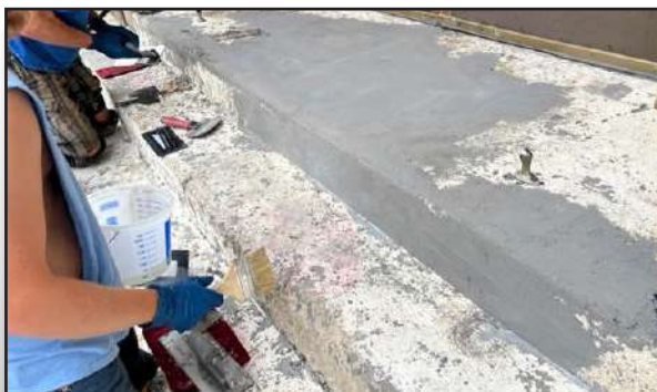
Damage repaired with DuraQuartz