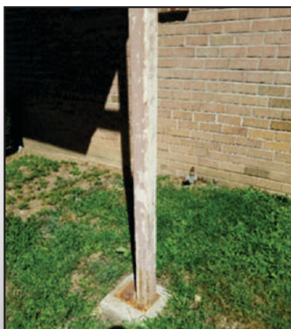
After 7 years...