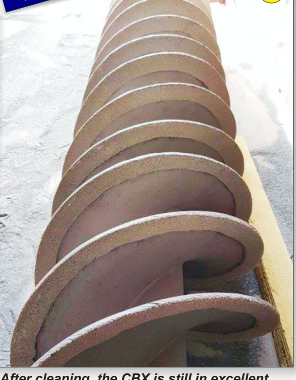
After cleaning, the CBX is still in excellent condition.

6 Platinum Court • Medford, NY 11763 Toll Free: 888-4-ENECON<sup>®</sup> (888-436-3266) • Phone: 516-349-0022 • Fax: 516-349-5522 www.enecon.com • info@enecon.com