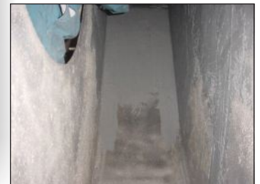
Interior was severely eroded, with many holes penetrating the walls. DurAlloy was used to rebuild all surfaces.

This stainless steel fan housing at a major mid-Atlantic wastewater treatment facility, which processes over 40 million gallons of wastewater per day, had been taken out of service due to severe erosion & corrosion damage caused by the hot, acidic exhaust gases from their incinerator which pass through this air handler.