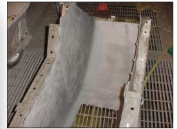
Surfaces were blasted to minimum 3 mil profile.