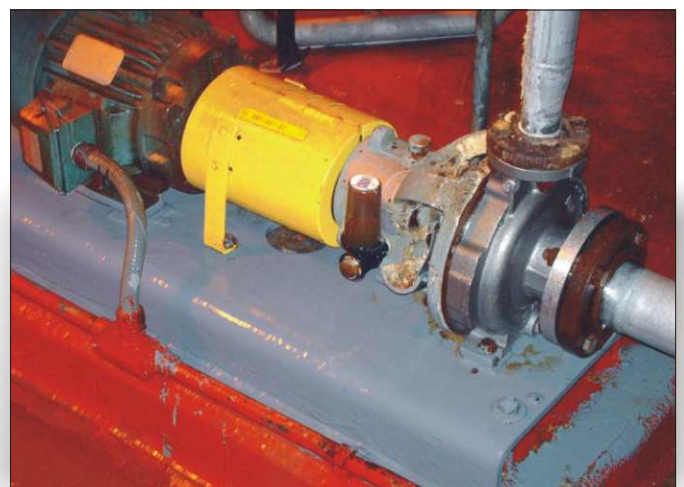
Chemical spill washed off pump base. Note: CHEMCLAD XC is in perfect condition.

700 Hicksville Road • ENECON Center Suite 110 • Bethpage, NY 11714 Toll Free: 888-4-ENECON • Phone: 516.349.0022 • Fax: 516.349.5522 Website: www.enecon.com • Email: info@enecon.com