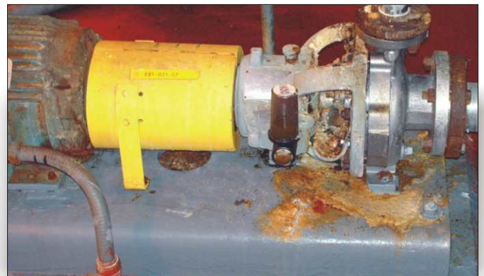
Chemical spill after pump base protected with CHEMCLAD XC.