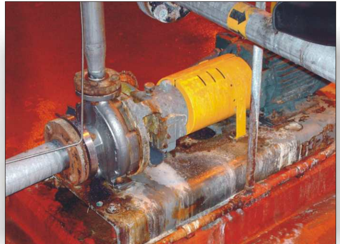
Pump base before application of CHEMCLAD XC.

The Dealer recommended CHEMCLAD XC to protect these pump bases. These 'before' and 'after' photos certainly speak for themselves.