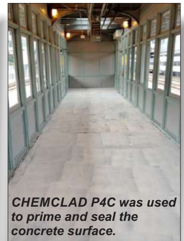
CHEMCLAD P4C was used to prime and seal the concrete surface.