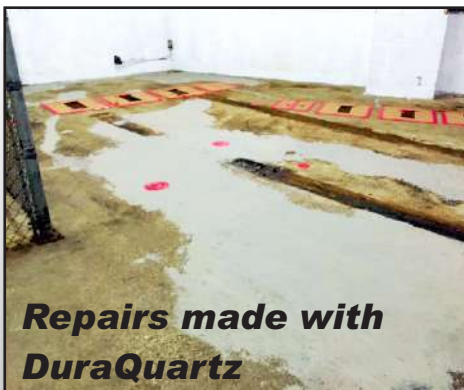
Repairs made with DuraQuartz

The ENECON solution not only repaired and protected the concrete, solved safety issues and reduced the odor but also saved the park $25,000 from having to replace the concrete.