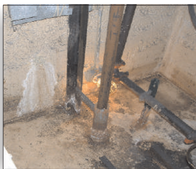
Elevator Pit Before

The project was completed on time. The client and the State inspector were both very pleased with the results."