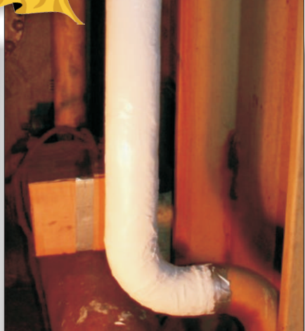
Final coat of ENESEAL CR

6 Platinum Court • Medford, NY 11763 Toll Free: 888-4-ENECON • Phone: 516-349-0022 • Fax: 516-349-5522 www.enecon.com • info@enecon.com