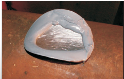
Stainless steel patch with DurAlloy