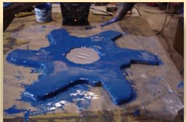
The wear plate after the application of DuraTough DL with the mold removed.