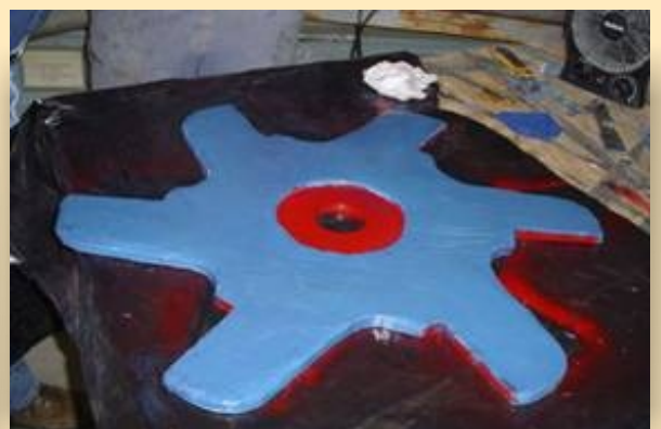
The finished wear plate.