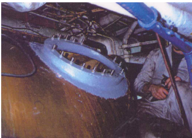
Damage repaired with CeramAlloy CP+