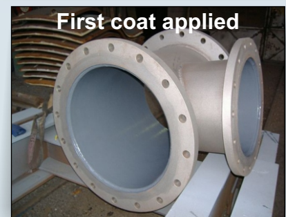
First coat applied