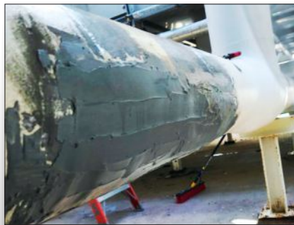
Repairs made with DurAlloy.