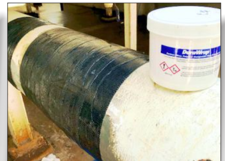
Reinforcing with DuraWrap.