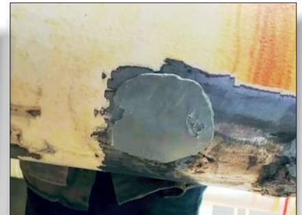
SpeedAlloy QS stops the leaks.