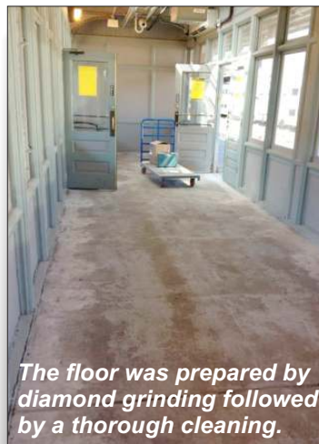
The floor was prepared by diamond grinding followed by a thorough cleaning.