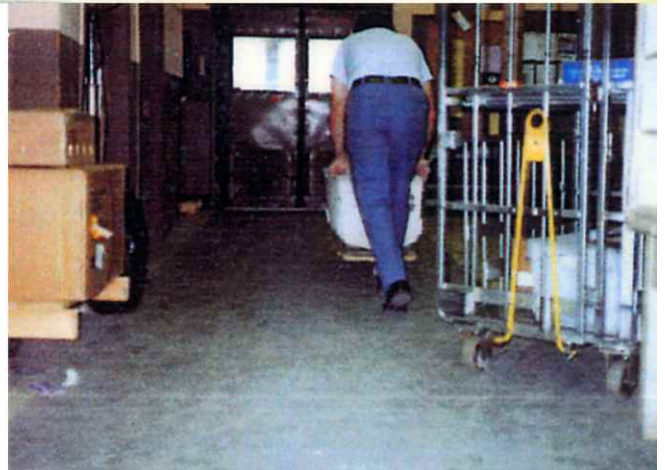
DuraQuartz providing years of trouble-free performance at Postal Center loading area.